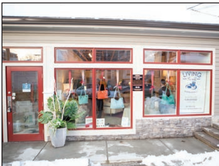
Living Swell is located at 34C Atlantic Avenue, Marblehead MA.