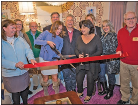
Members of the Marblehead Chamber of Commerce participate in the ribbon cutting to celebrate the grand opening of Living Swell.